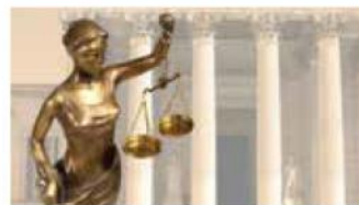
GENERAL & PRODUCTS LIABILITY