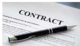
ERRORS AND OMISSIONS