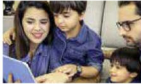
FAMILY CYBER (PERSONAL LINES)