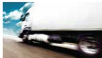
AUTOMOBILE/ TRUCKERS LIABILITY