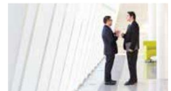
PROPERTY & CASUALTY FACULTATIVE