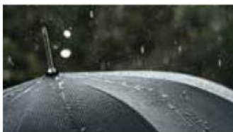
UMBRELLA/ EXCESS LIABILITY

When underwriting support is paramount to achieving success, our Casualty Treaty & Program solutions provide our partners excellent answers for risk selection, pricing and risk transfer. We can help with lines, classes or books of business.