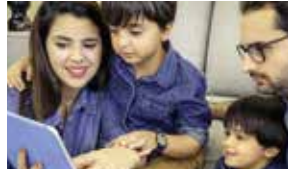
FAMILY CYBER (PERSONAL LINES)