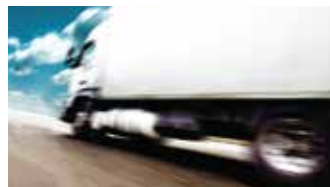
AUTOMOBILE/ TRUCKERS LIABILITY