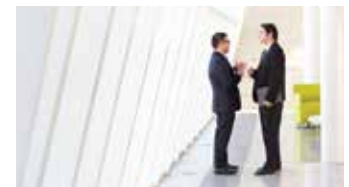
PROPERTY & CASUALTY FACULTATIVE