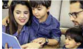
FAMILY CYBER (PERSONAL LINES)