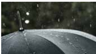
UMBRELLA/ EXCESS LIABILITY

When underwriting support is paramount to achieving success, our Casualty Treaty & Program solutions provide our partners excellent answers for risk selection, pricing and risk transfer. We can help with lines, classes or books of business.